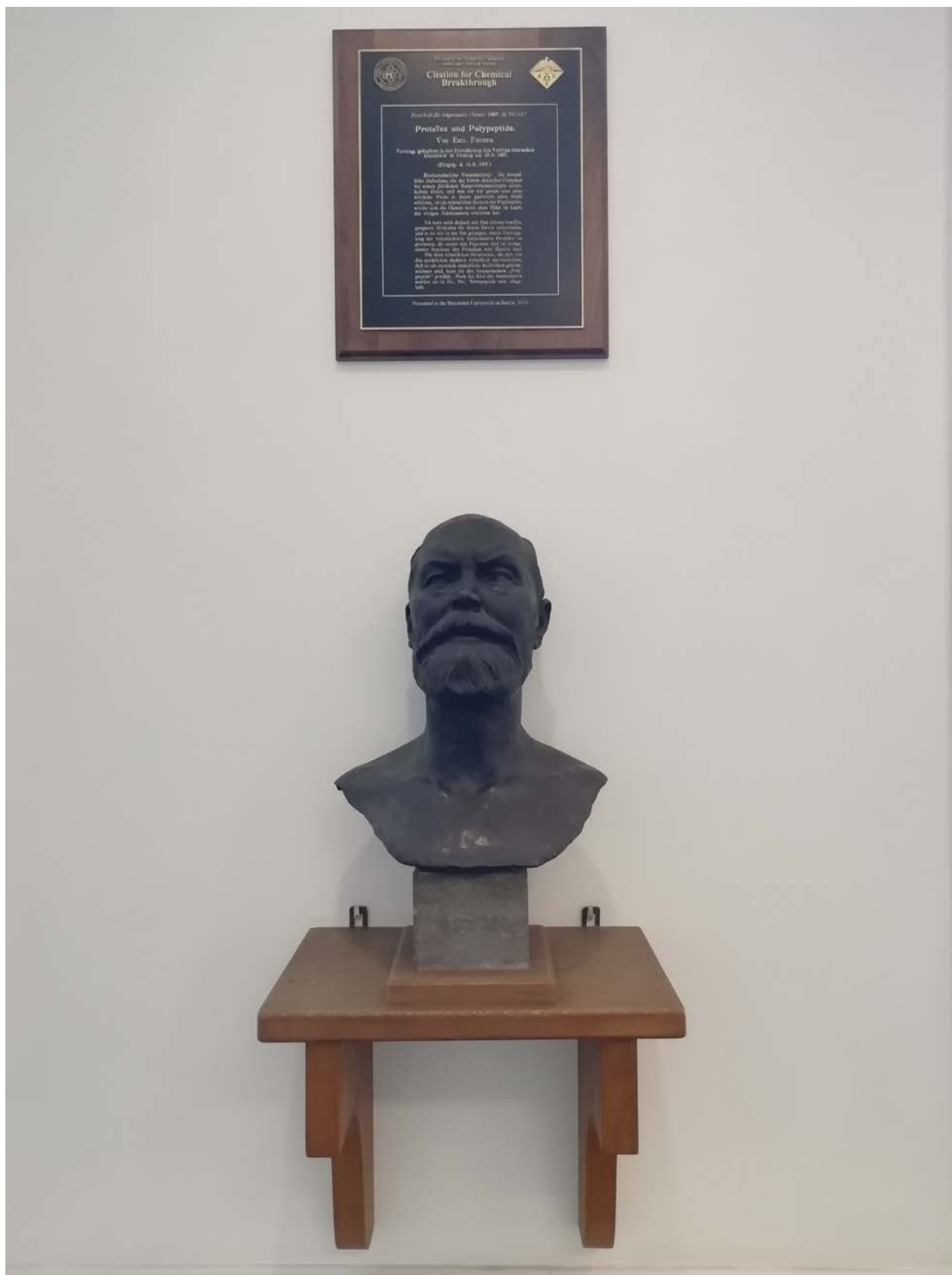
Bust (1905) of Emil Fischer by Fritz Klimsch (1870-1960) and the ACS HIST Citation for Chemical Breakthrough Award to Humboldt Universität zu Berlin for Emil Fischer's 1907 paper "Proteine und Polypeptide," Zeitschrift für Angewandte Chemie 1907, 20, 913-917.

Information and photographs of the award symposium on the next pages -->